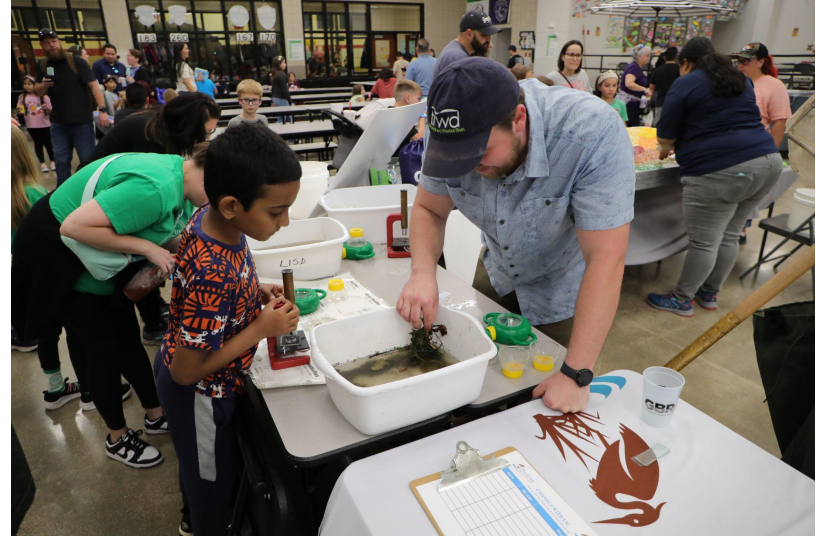
Negley Elementary: STREAMS Night

Would monthly updates on PCWP activities be beneficial?