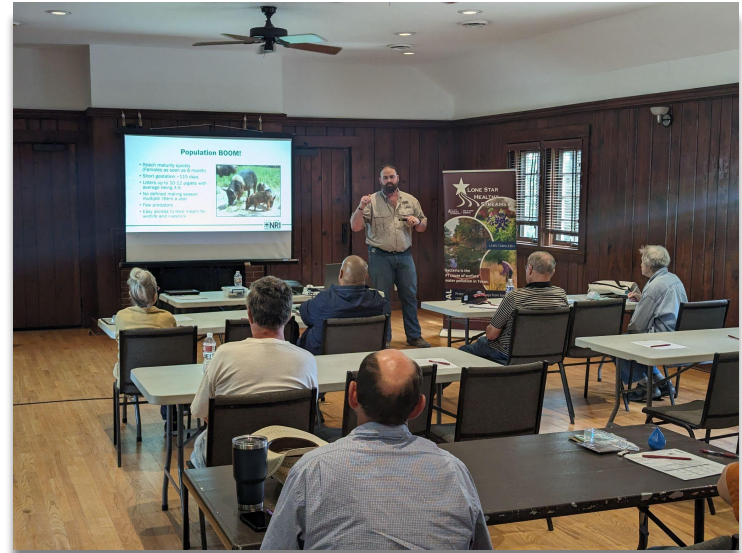
Lone Star Healthy Streams Workshop