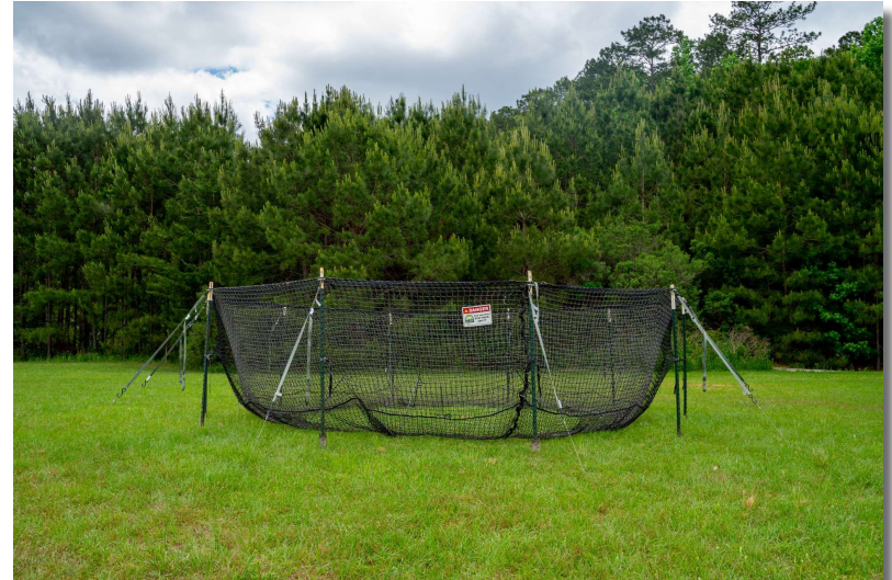
Pig Brig net trap system