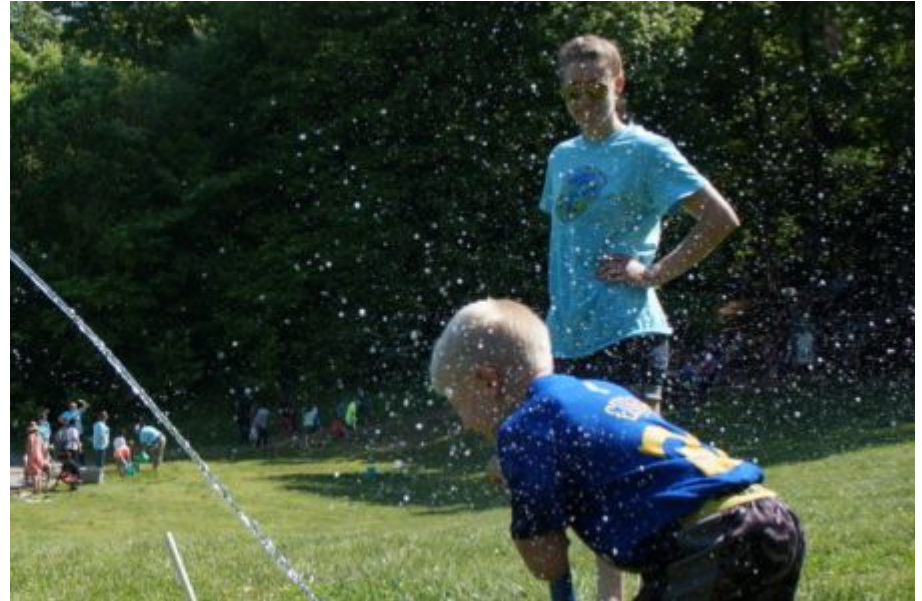
Waterfest (Water Quality Forum)