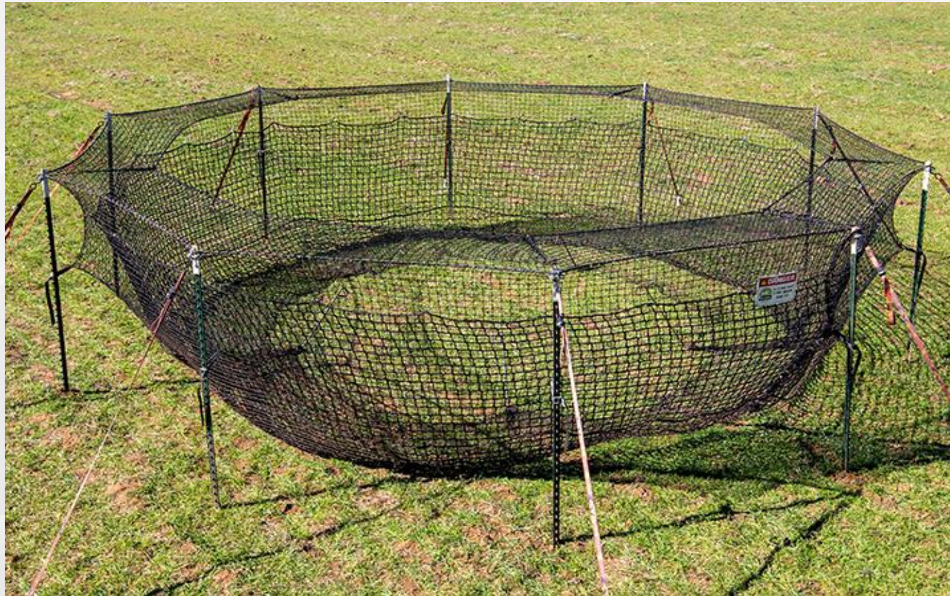
Pig Brig Trap System