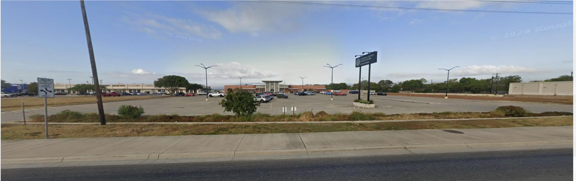
Caldwell County Justice Center, Lockhart Texas